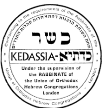
Kedassia of London, UK