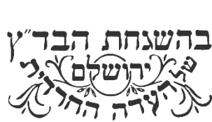
Eida Hachereidus Badatz of Yerushalayim