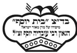
Bet Din Zedek/Bet Yosef Hacham Rav Ovadia Yosef zt"l