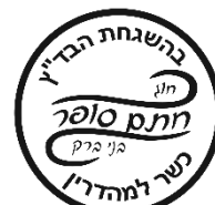
Chug Chatam Sofer of B'nei Brak